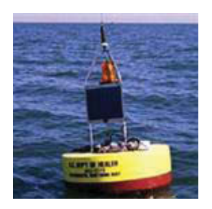
EMM700 Water Quality Monitoring Buoy

The PISCES is a lightweight pontoon platform which supports water quality, water velocity and meteorological sensors as well as computer logging systems. The platform holds two topside aluminium chests that house the data aquisition system, cellular modem, and battery. The chests are easily serviceable from the water and accommodate mutiple underwater cable connections.