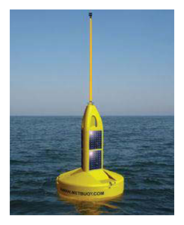
Weather Buoy / Data Buoy / Oceanographic Buoy operated by the MDS

Weather Buoy operated by NOAA National Data Buoy Center