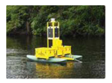
EMM350 PISCES Platform

The PISCES is a lightweight pontoon platform which supports water quality, water velocity and meteorological sensors as well as computer logging systems. The platform holds two topside aluminium chests that house the data aquisition system, cellular modem, and battery. The chests are easily serviceable from the water and accommodate mutiple underwater cable connections.